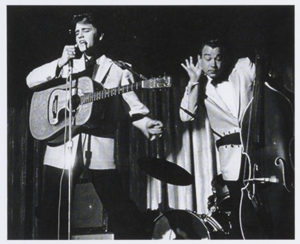
Come again? Elvis sings, Black listens, 1956.