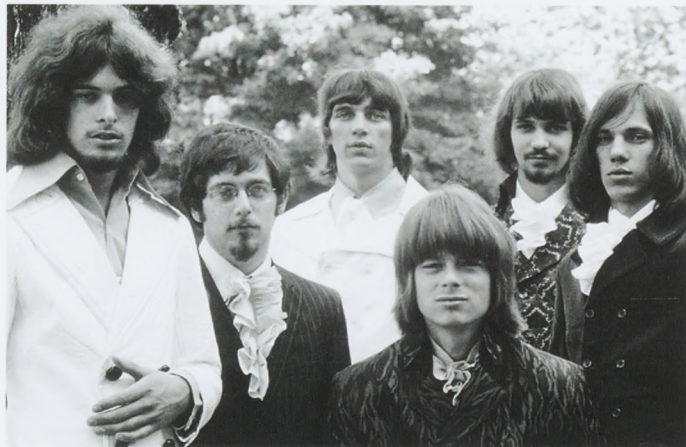
The Amboy Dukes, including future Motor City Madman Ted Nugent (far left)

Crenshaw still marvels at "how many local records were major hits in Detroit. The Unrelated Segments, for example, had two hit singles on our Top Forty station, WKNR. The raw garage-type rock records were also very big – 'You're Gonna