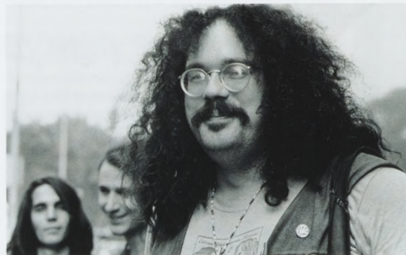
MC5 provocateur and White Panther Party founder John Sinclair

By the end of 1971, the big rock festivals were over and the White Panther communes had begun to splinter. The Grande Ballroom closed for good after the MC5 played its last-ever show there on New Year's Eve, 1972. "Everybody