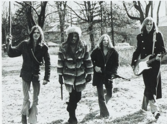
The Up: White Panther house band and Michigan's "militia," 1970