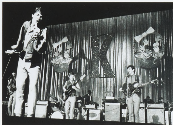
Below: Mitch Ryder and the Detroit Wheels