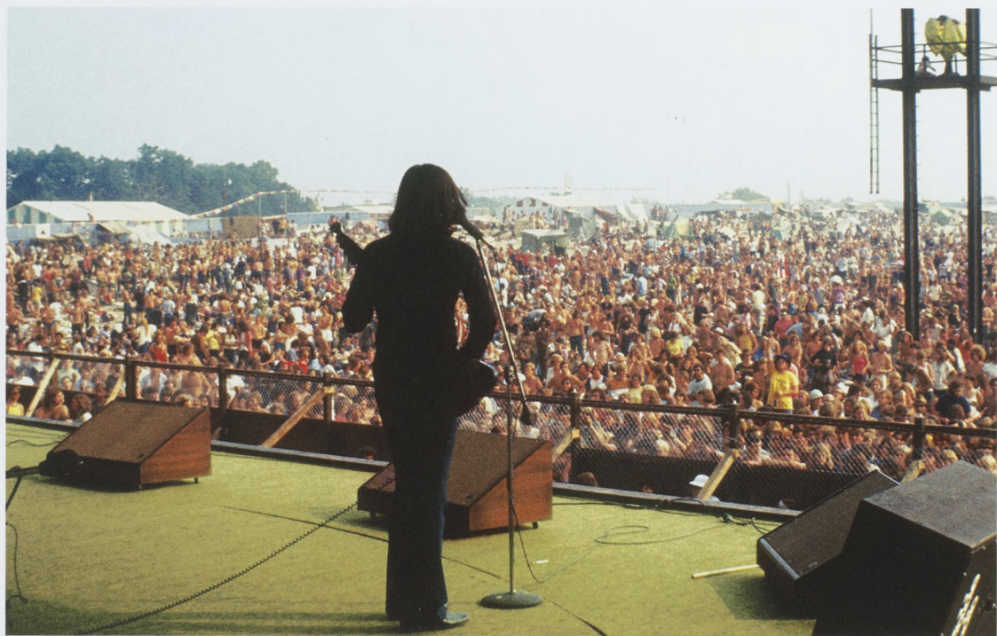
Right: Seger, at home, circa 1981. Above: Seger plays to a hometown crowd at the Goose Lake Festival, 1970.