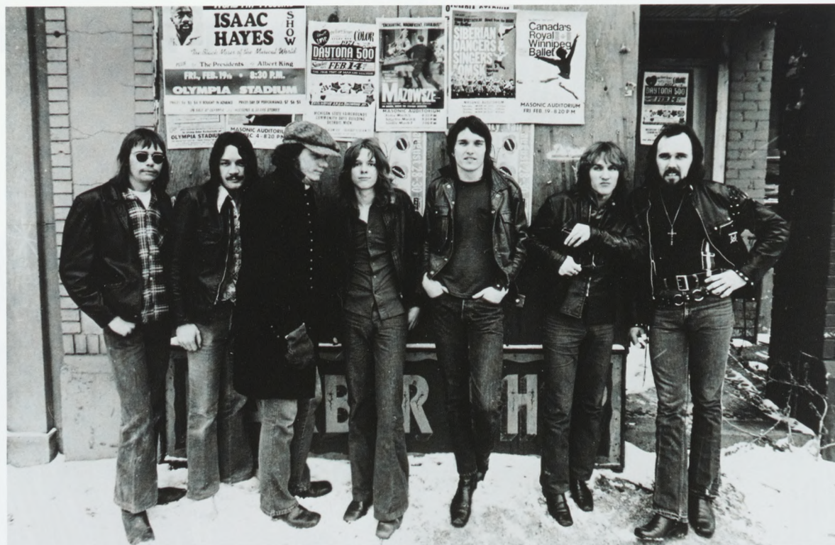
Mitch Ryder (second from left), formerly of the Detroit Wheels, with his band Detroit, which he formed in the early seventies