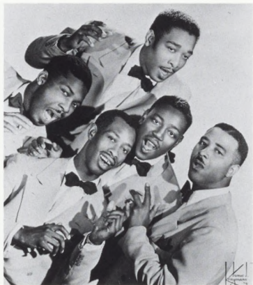
The "S" Royales