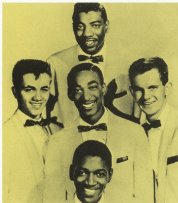
The Del Vikings