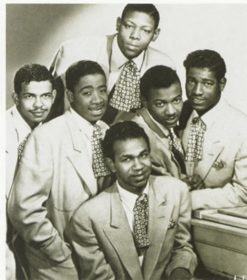
The Five Keys