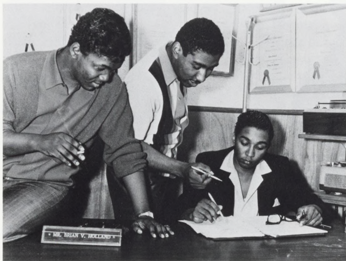
The songwriting team of Holland-Dozier-Holland