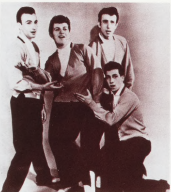
Dion and the Belmonds