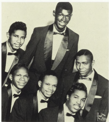
Lee Andrews and the Hearts