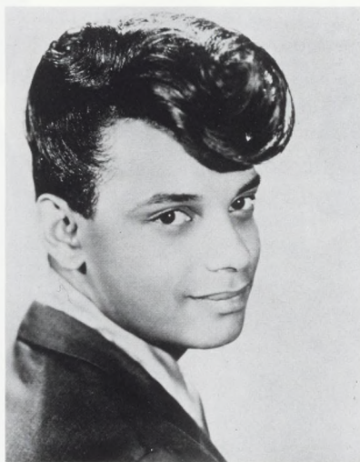
Gary "U.S." Bonds