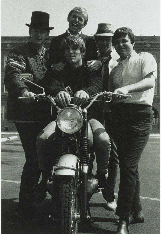
the beach boys

According to the wag, there is no "there" in Oakland, vet San Francisco's East Bay has forged a modest yet significant musical presence with some key California artists. The boogie of El Cerrito's own Creedence Clear-water Revival rightly belongs to fans from Lodi to the bayou, thanks to nine consecutive Top 10 singles. But sounds more representative of San Francisco's downhome sister can be found in the East Bay Grease of Tower of Power and the dazzling diversity of Sly & The Family Stone. The clan's canny funk-rock