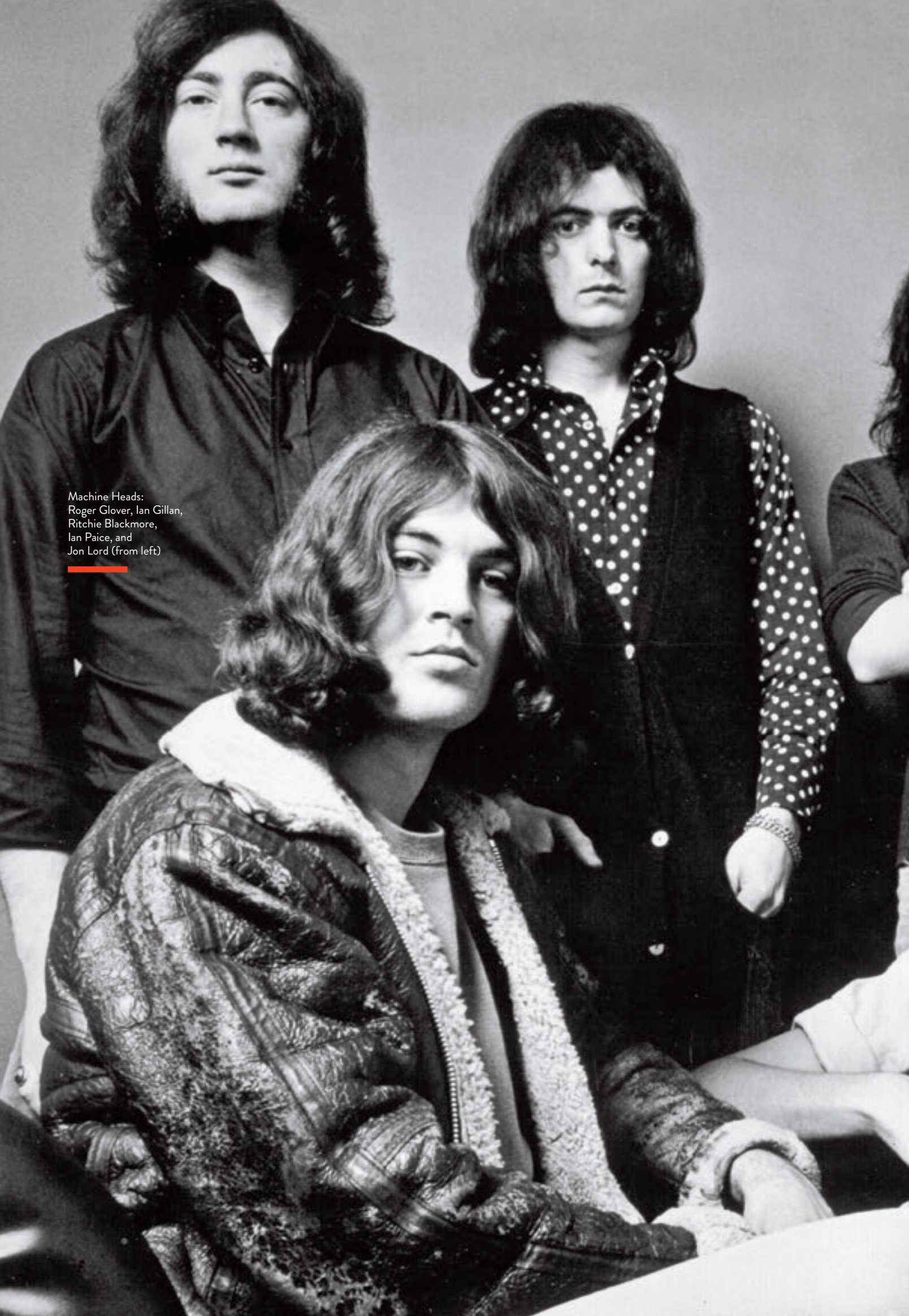
Machine Head: Roger Glover, Ian Gillan, Ritchie Blackmore, Ian Paice, and Jon Lord (from left)