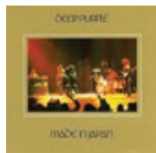
MADE IN JAPAN