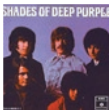
SHADES OF DEEP PURPLE