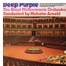
CONCERTO FOR GROUP AND ORCHESTRA