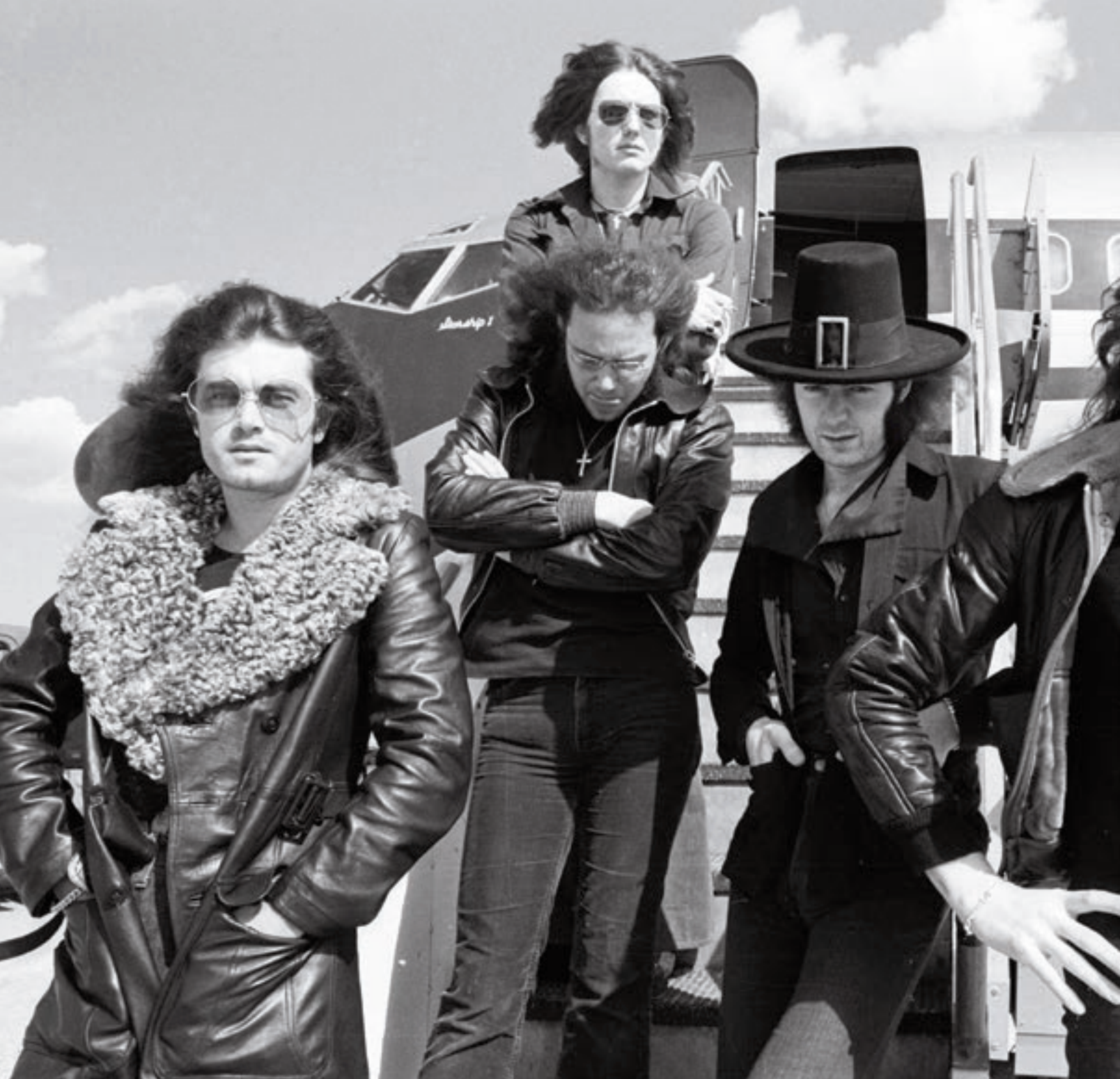
This spread, clockwise from left: Deep Purple, Mk III: Glenn Hughes, Paice, David Coverdale (top), Blackmore, and Lord (from left); Hughes and Coverdale, 1974; Blackmore shreds onstage, flanked by Hughes, 1974.

Paice, the sole member to bash with the band from Day One.