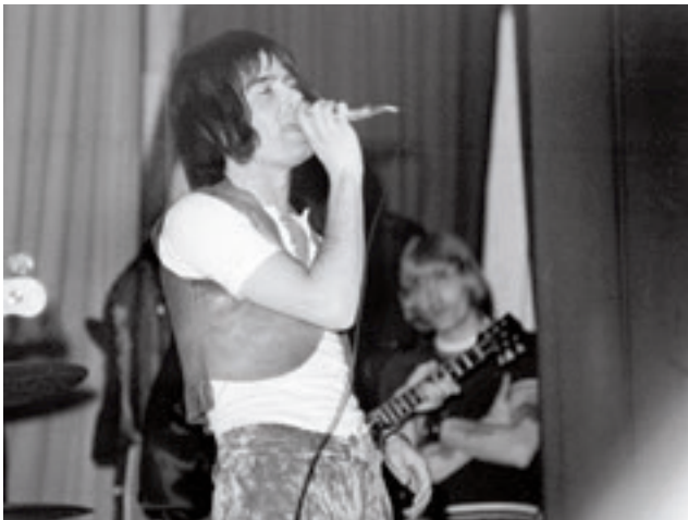
This page, from top: With Royal Philharmonic Orchestra conductor Malcolm Arnold, 1969; Rod Evans, original lead singer with Deep Purple, 1969. Opposite page: In 1969.

and Deep Purple,” according to guitarist extraordinaire Tom Morello. “They are the Holy Trinity of hard rock and metal bands.”