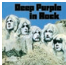
DEEP PURPLE IN ROCK