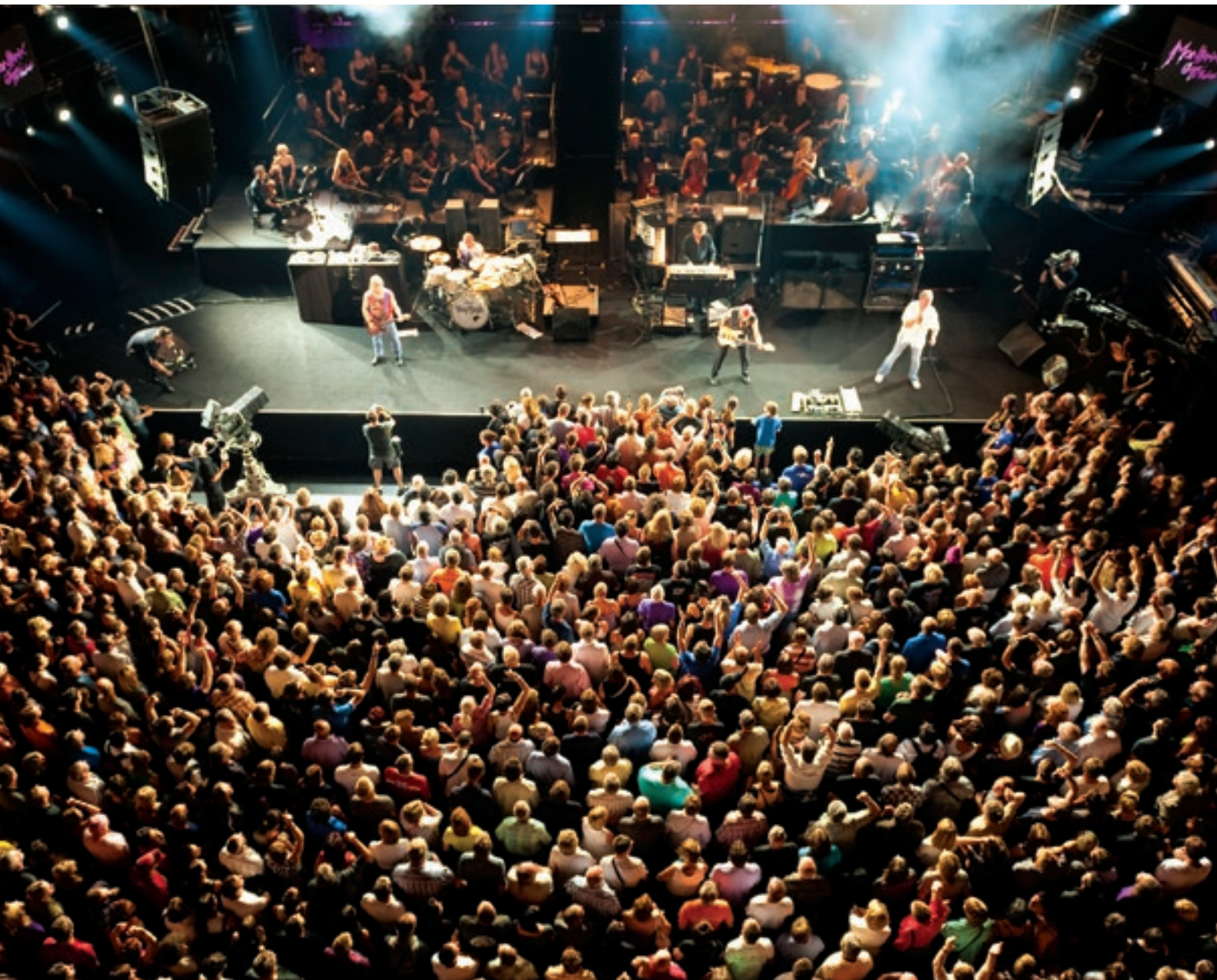
Live in 2011, back in Montreux, where “Smoke on the Water” was born

group did manage some high points on Who Do We Think We Are (1973), especially the catchy single, “Woman From Tokyo.” More exciting was a live album, Made in Japan , cut in 1972 in Osaka and Tokyo, which showed both the potency of the band in concert and its improvisational skill, evident in a nineteen-plus minute take on “Space Truckin’.”