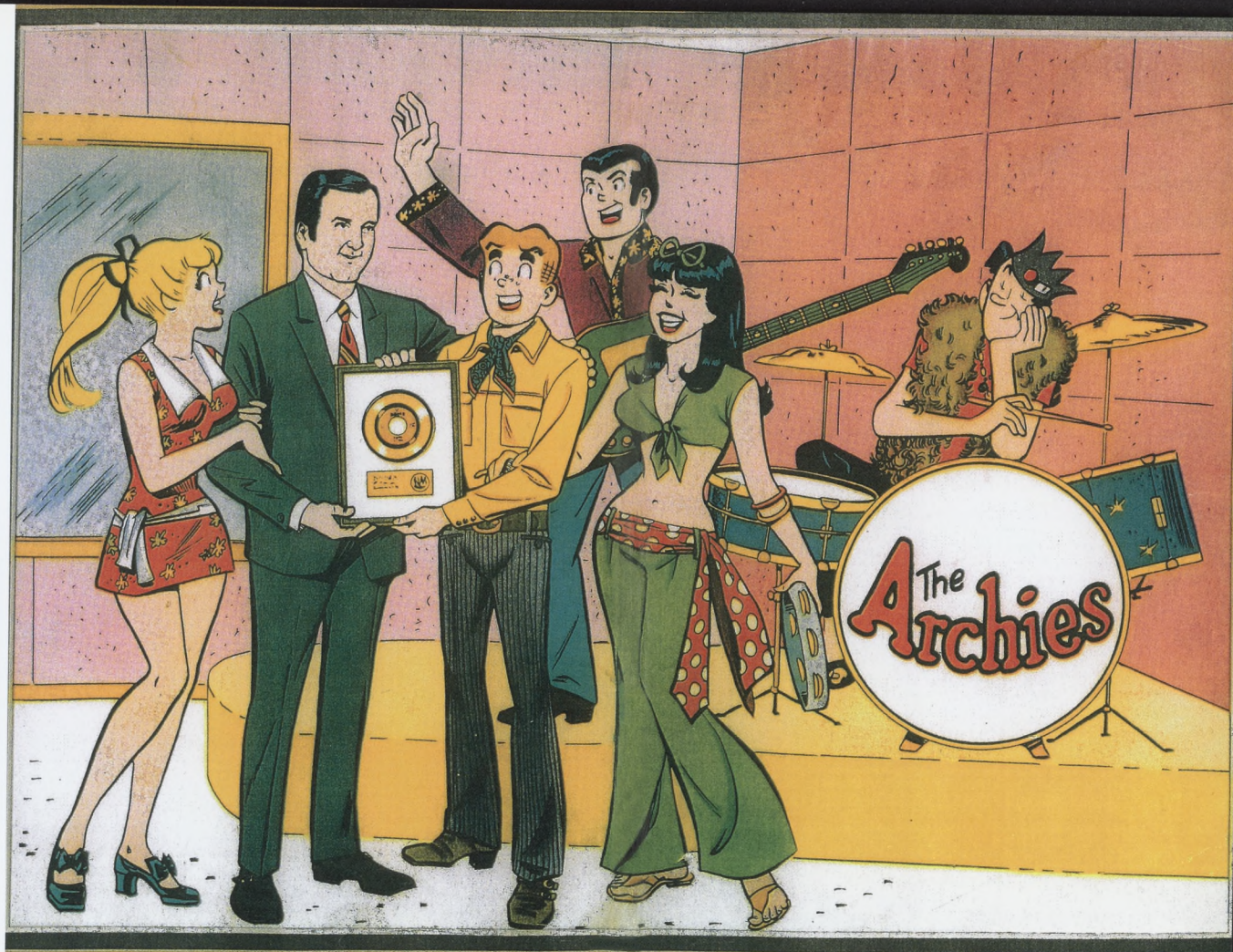
Kirshner with the hitmaking Archies—Betty, Archie, Reggie, Veronica, and Jughead (from left)

and Greenfield to her New Jersey home. She chose their song “Stupid Cupid” for her next single, and Aldon had its first hit.