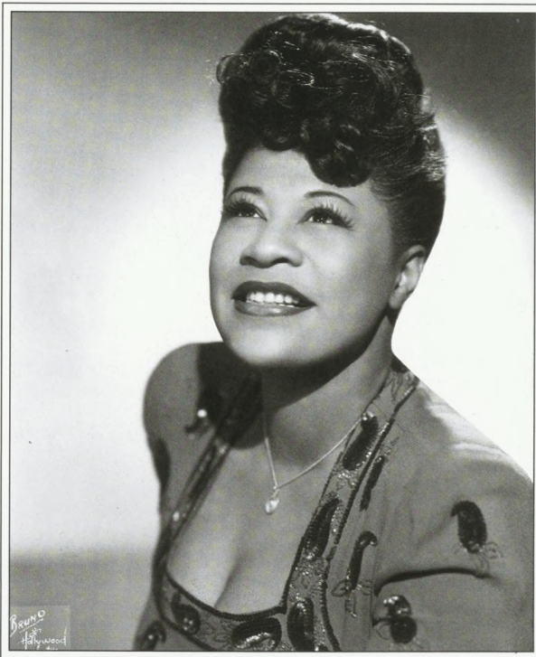
Ella Fitzgerald, erstwhile Chick Webb vocalist, soon after World War II

With the success of Mahalia Jackson's first recording in 1937, "God's Gonna Separate the Wheat From the Tares," the influence of gospel began to be felt in secular music, and the evangelical fervor of Sister Rosetta Tharpe, soon to appear at the Cotton Club, was wedded to the big-band drive of Lucky Millinder's Orchestra. At the threshold of the Forties, the sounds of