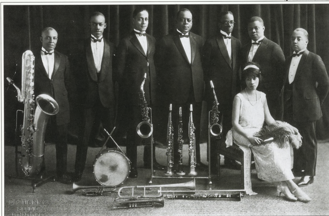
King Oliver's Creole Jazz Band of 1924 featured the young cornetist Louis Armstrong, second from right.