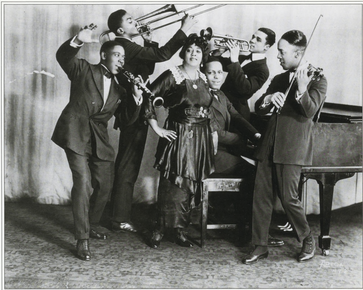
Mamie Smith's Jazz Hounds with Willie "the Lion" Smith at the piano in 1920: Smith made the first blues recording, "Crazy Blues," the same year for Okeh.

NBC in August 1932, touting the new trio and their network program. Even hard-shell Southern newspapers printed the story and, for the first time, a photograph of black artists.