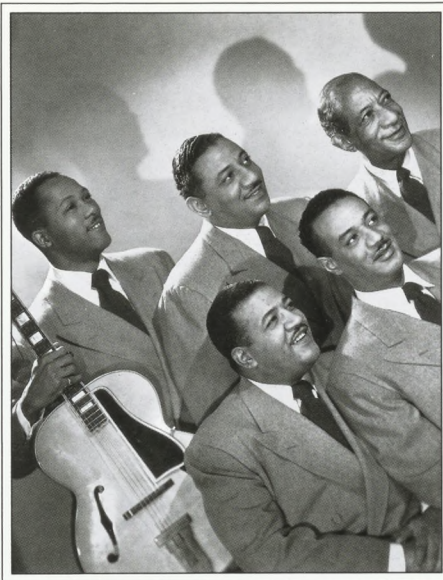
In the Thirties the Mills Brothers were superstars; Brunswick paid them a fee of $500 for every record.

Many other vocal groups soon filled the dial with fifteen-minute spots every day of the week, but the Mills Brothers quickly achieved superstar status. Under the skillful guidance of Tommy