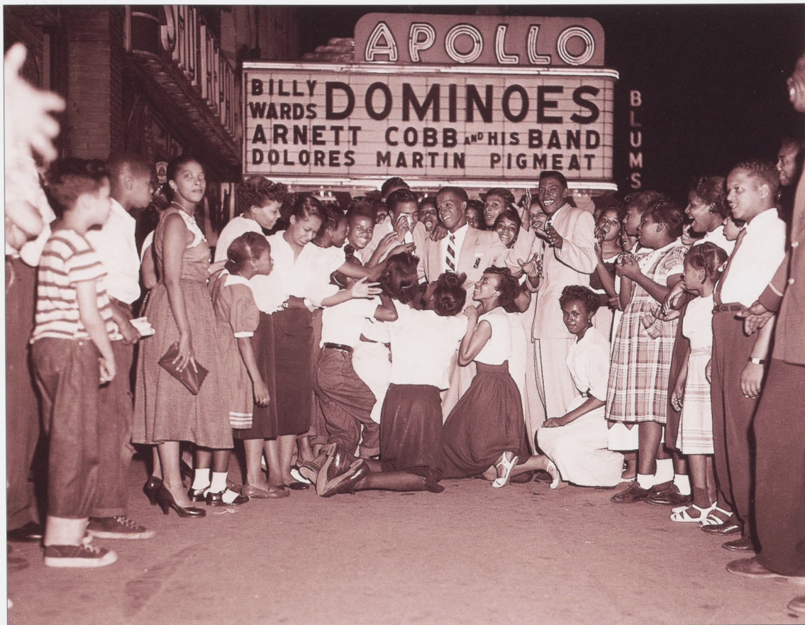
Contours, Marvin Gaye and Stevie Wonder.

As usual, other theaters followed the Apollo pattern. Recorded live at Chicago's Regal Theater in 1963, Little Stevie himself first pounced up the charts with the exuberant "Fingertips (Part 2)." The Regal similarly provided a launch point for Gene Chandler's plaintive "Rainbow '65," as well as B.B. King's legendary Live at the Regal album of the same year. Brown chose Baltimore's Royal as his 1963 Apollo followup, Pure Dynamite! A decade and a half later, in 1978, the Brides of Funkenstein opted to record the landing of the Mothership at Washington, D.C.'s Howard Theater.