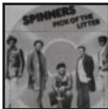
Pick of the Litter 1975 (Atlantic)