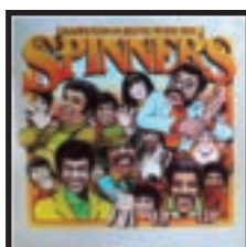
Happiness Is Being With the Spinners 1976 (Atlantic)

On The Midnight Special, 1976. OPPOSITE PAGE: Riding high in 1974.