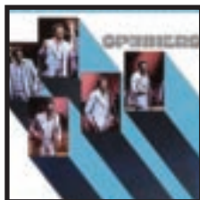
Spinners 1973 (Atlantic)