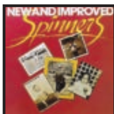
New and Improved 1974 (Atlantic)