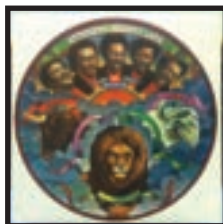
Mighty Love 1974 (Atlantic)