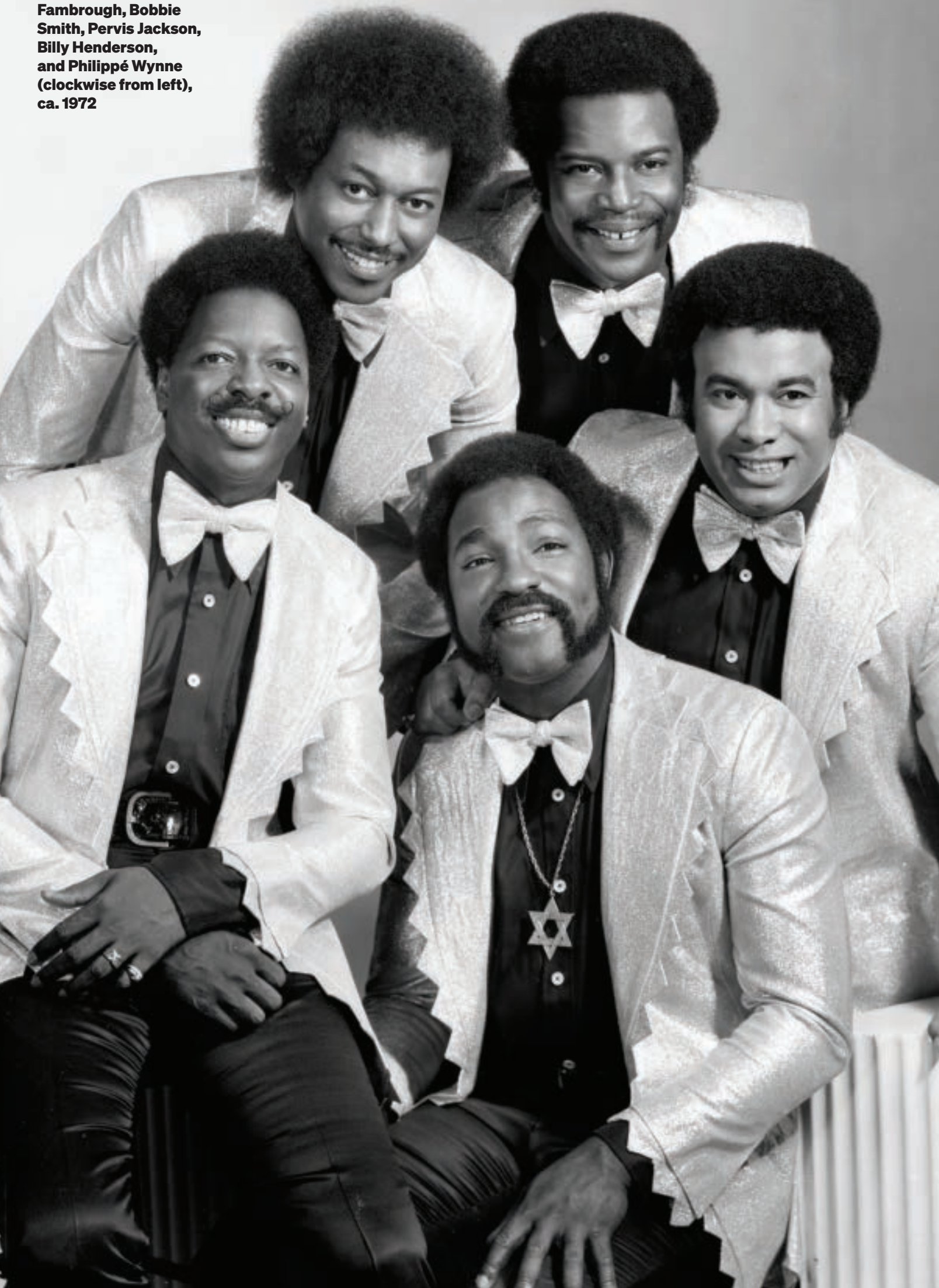
The classic Spinners lineup: Henry Fambrough, Bobbie Smith, Pervis Jackson, Billy Henderson, and Philippé Wynne (clockwise from left), ca. 1972